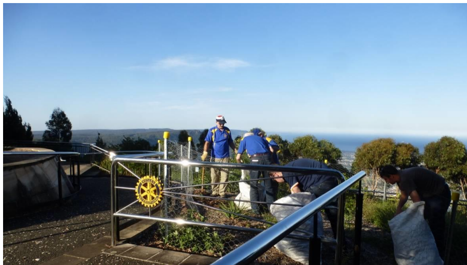
Rotary volunteers serving Mount Keira since 1950's

In addition, we recommend that the Plan of Management includes Mountain Biking as a permissible use.