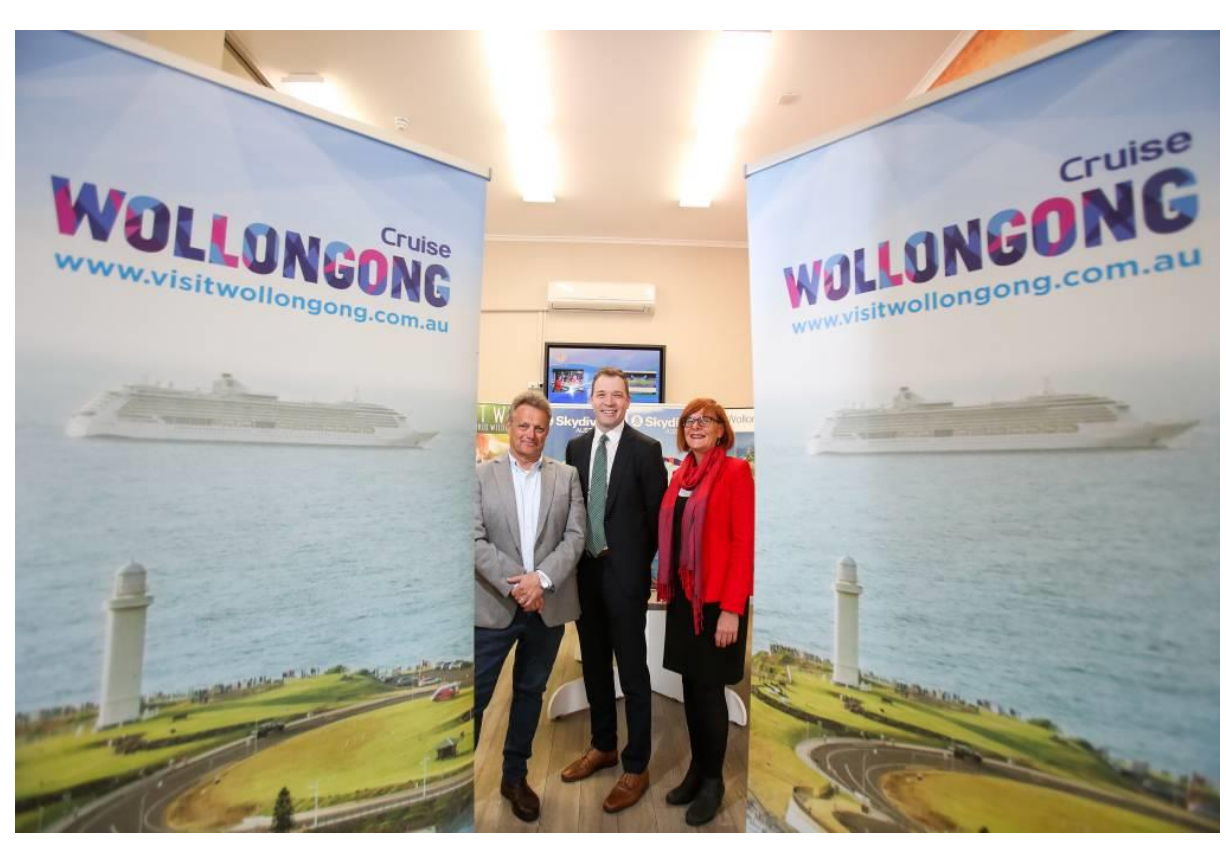
Illawarra Mercury, 5 September 2018

Activity: Advocate for Tourism catalyst projects