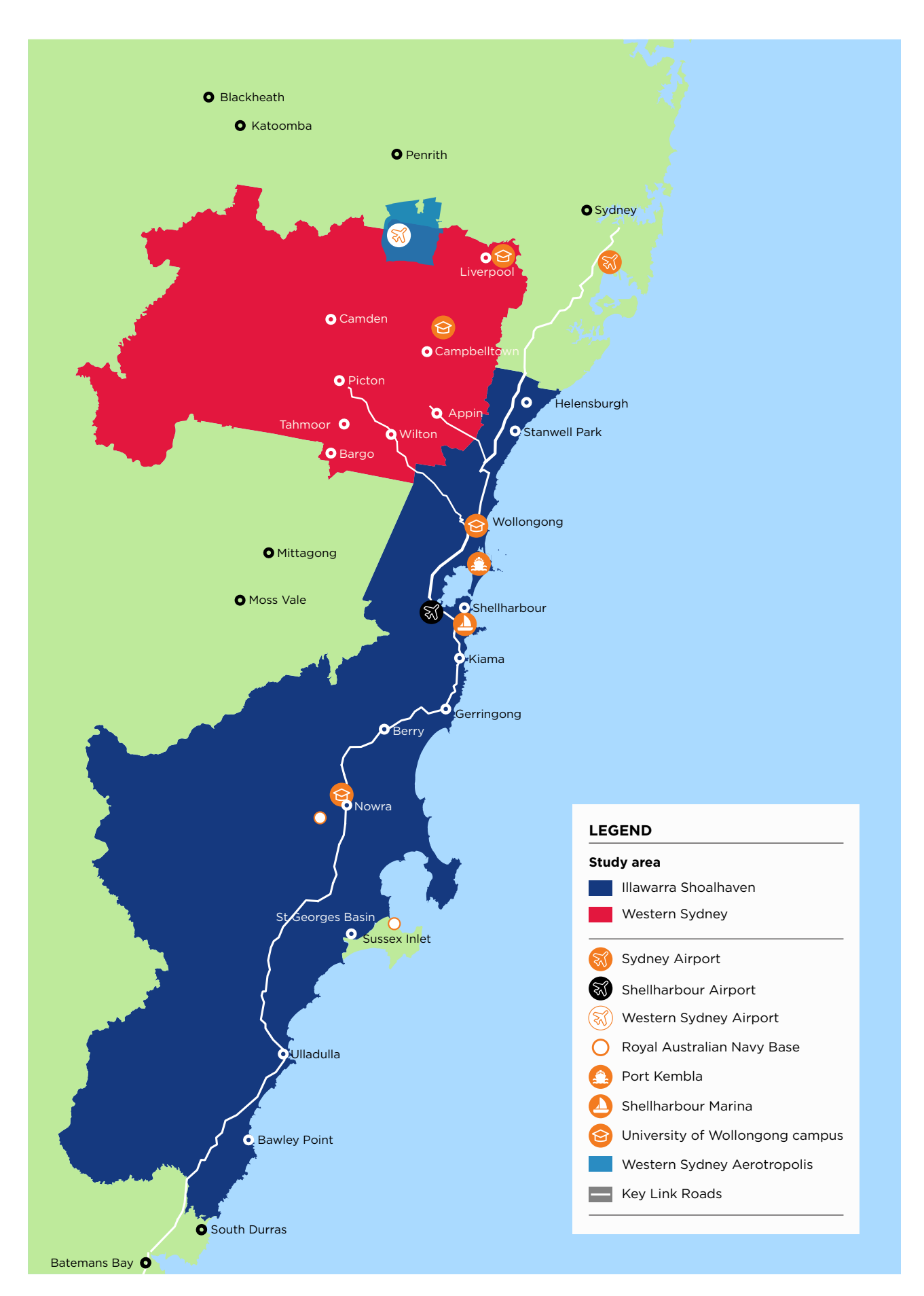
Figure 1: Western Sydney and Illawarra Shoalhaven collaboration area