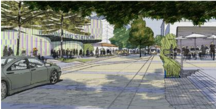
Station precinct and 'Gateway'