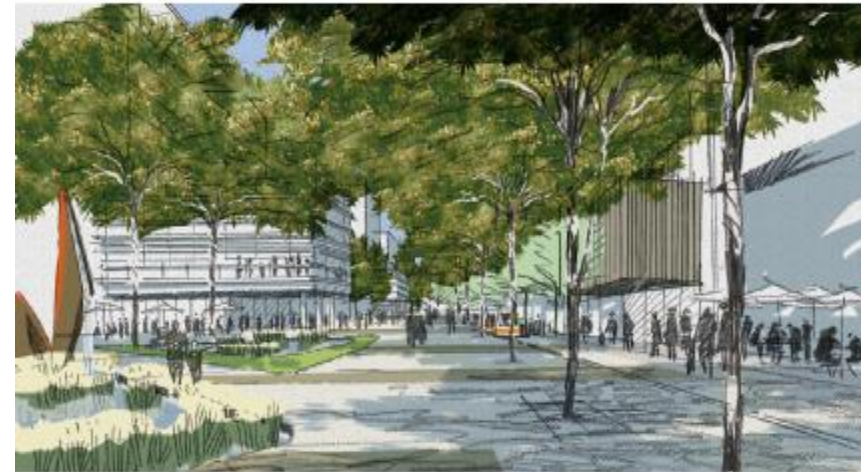
Retail precinct Crown Street