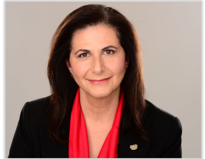
The Hon. Senator Concetta Fierravanti-Wells

Watch the video to learn about RDA Illawarra's achievements and future initiatives, including growth of Port of Port Kembla opportunities here .